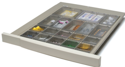
Large cabinet drawer – all pocket types shown.

Only the pocket of the selected medication can be opened.