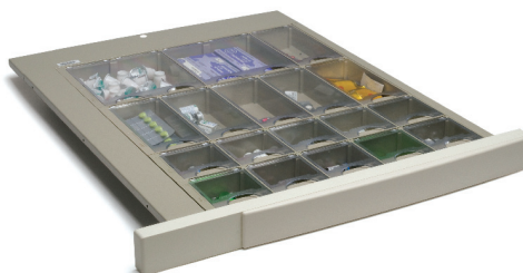
Large cabinet drawer – all pocket types shown.

Each pocket has an unlocked, clear plastic lid. If an incorrect pocket is opened, an advisory screen alerts the user.