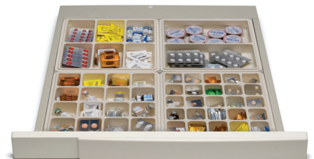
Large cabinet drawer – all pocket types shown.

High Capacity Open Drawers hold four inserts. Users choose the types of inserts that best meet their needs.