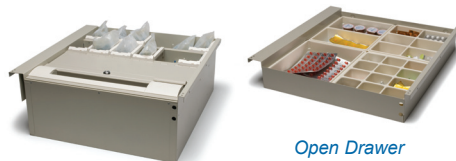
Tall Matrix Drawer for large cabinets – highly configurable with removable dividers; holds up to 24 line items. Pictured with optional return bin.

Standard and Tall open drawers are available: Matrix Drawer (for small main or small auxiliary cabinets), Tall Matrix Drawer and Open drawers. Easy removable dividers or interchangeable inserts provide maximum storage flexibility. An optional large return bin can be located in the front half of the Tall Matrix Drawer.