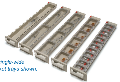
All single-wide pocket trays shown.

The UDD drawer fits in one standard drawer slot. Each tray is individually controlled and opens to allow access to only a specific medication pocket. There are 12 single-wide trays or 6 double-wide trays available, each with five different pocket configurations.