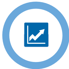
Drive sales and support marketing strategies