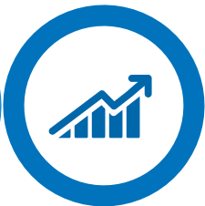
Monitor market performance