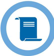
Customer target list