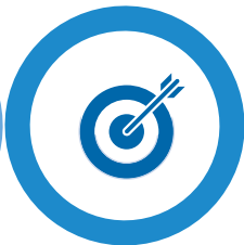
Build accurate budgets and forecasts