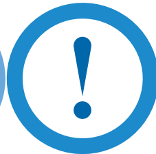
Generic drug supply shortage