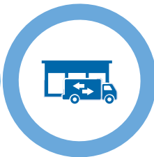
Support your supply chain management