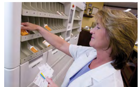
Retrieve the labelled, filled, capped and sorted vials