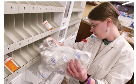
Replenish while prescriptions are filled